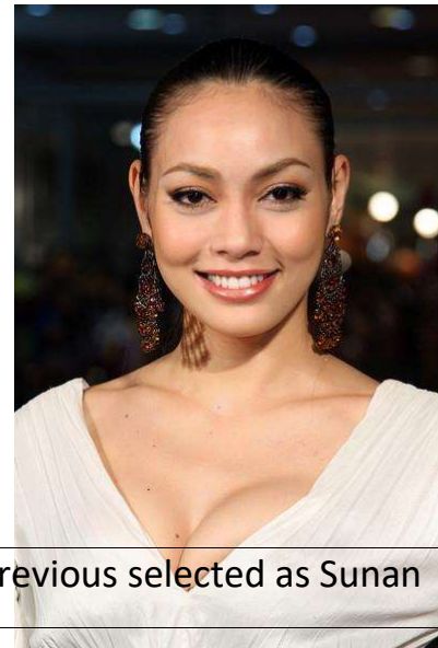
Previous selected as Sunan